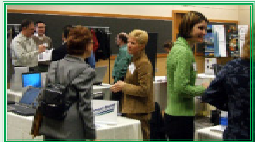
IFMA Vendor Trade Show